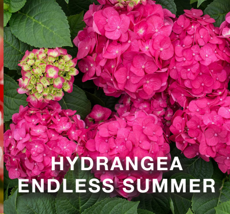
HYDRANGEA ENDLESS SUMMER