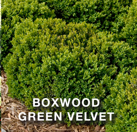
BOXWOOD GREEN VELVET