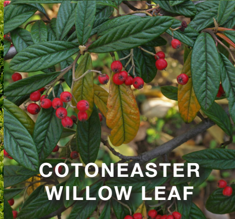
COTONEASTER WILLOW LEAF