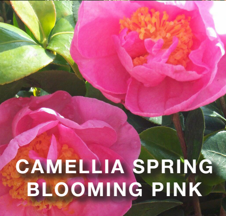
CAMELLIA SPRING BLOOMING PINK