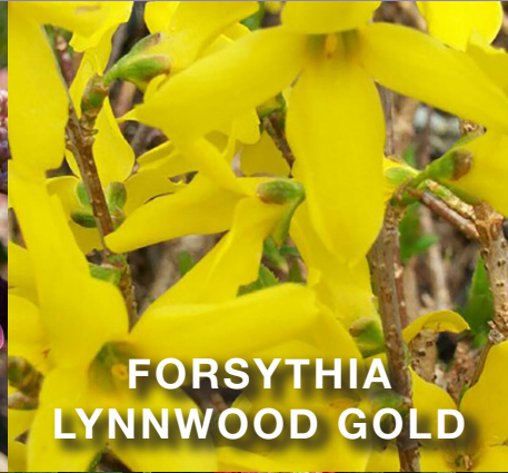
FORSYTHIA LYNNWOOD GOLD