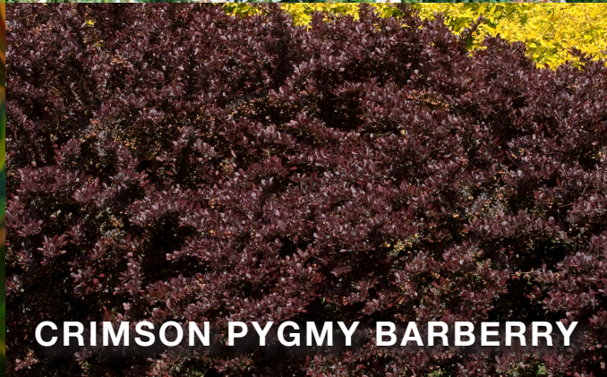
CRIMSON PYGMY BARBERRY