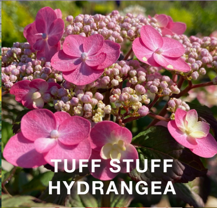
TUFF STUFF HYDRANGEA