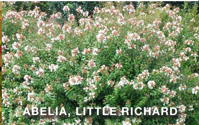
ABELIA, LITTLE RICHARD