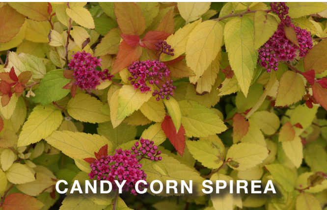
CANDY CORN SPIREA

No need to completely re-landscape your home. Keep the good foundation structure plants. Add blooms, leaf color, structure, and foliage to create a new and exciting look to your existing landscape. Easy to grow, cold hardy, and great value to enhance your existing landscape. Permanent low maintenance shrubs.