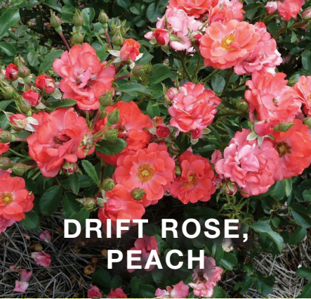
DRIFT ROSE, PEACH