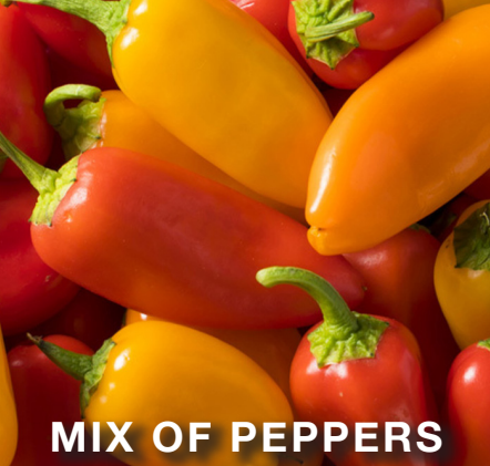
MIX OF PEPPERS