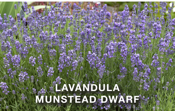
LAVANDULA MUNSTEAD DWARF

Grow your own fresh vegetables, herbs and cut flowers. Grow in garden boxes or in raised garden beds, or just in the garden on the ground. Good soil and sunlight is all that is needed to get started. Grow your own today!