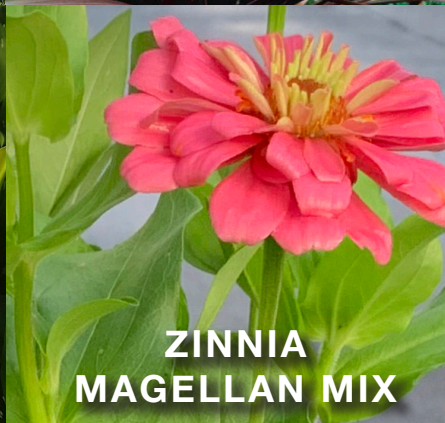
ZINNIA MAGELLAN MIX