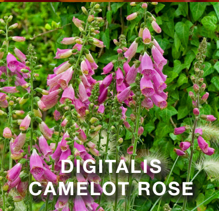
DIGITALIS CAMELOT ROSE