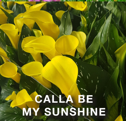
CALLA BE MY SUNSHINE