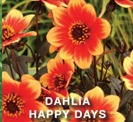
DAHLIA HAPPY DAYS