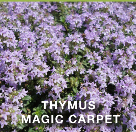
THYMUS MAGIC CARPET