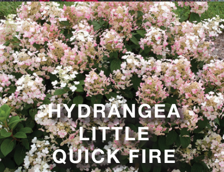
HYDRANGEA LITTLE QUICK FIRE