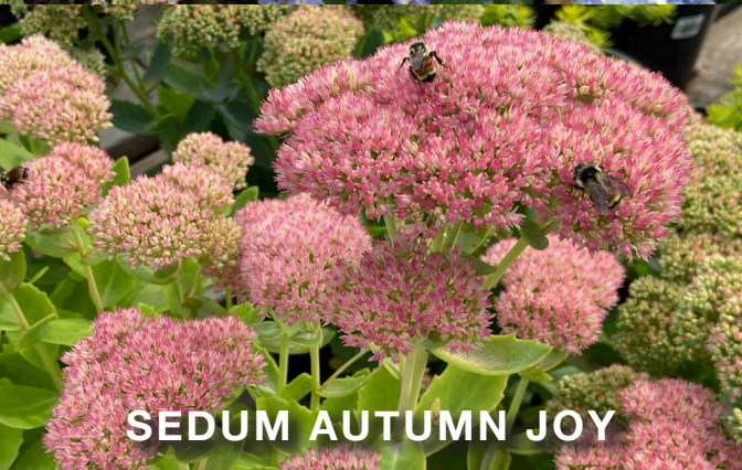
SEDUM AUTUMN JOY