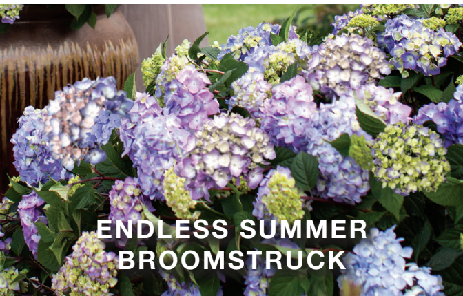
ENDLESS SUMMER BROOMSTRUCK

Use low care color shrubs, perennials, & ornamental grasses to infill and add color and interest to any landscape. Add accents for all seasons. When adding in new plants add in clusters of 3 or 5 of each variety, planting 2-3' apart for maximum effect.