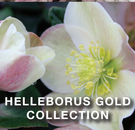
HELLEBORUS GOLD COLLECTION