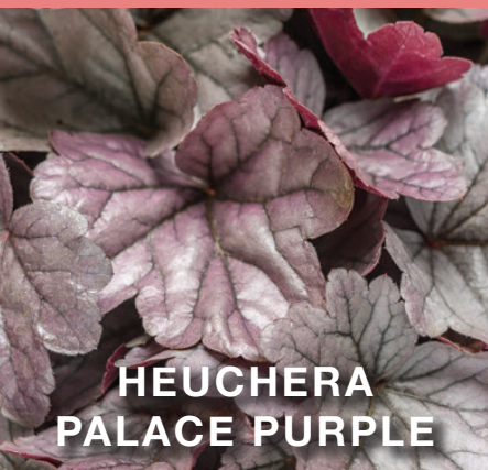
HEUCHERA PALACE PURPLE