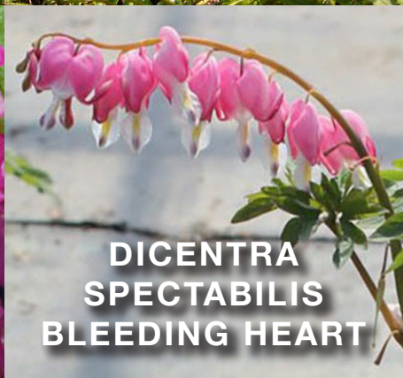
DICENTRA SPECTABILIS BLEEDING HEART