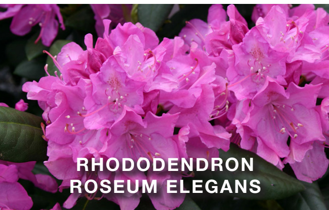
RHODODENDRON ROSEUM ELEGANS

Plant your shaded area with cool plants for cool shade. Choose from colorful flowers, colorful foliage, easy to grow for all types of shade. There are plants for dry shade and also for wet shade.