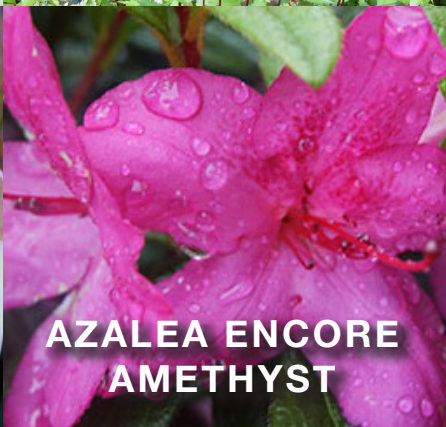
AZALEA ENCORE AMETHYST