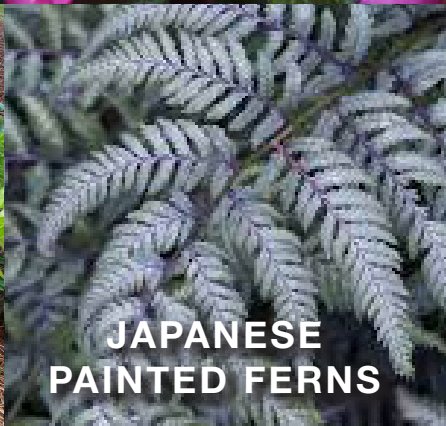
JAPANESE PAINTED FERNS