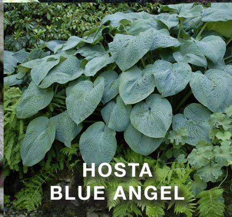
HOSTA BLUE ANGEL