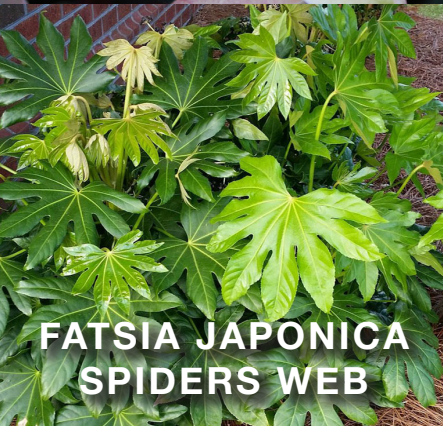
FATSIA JAPONICA SPIDERS WEB