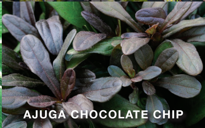
AJUGA CHOCOLATE CHIP