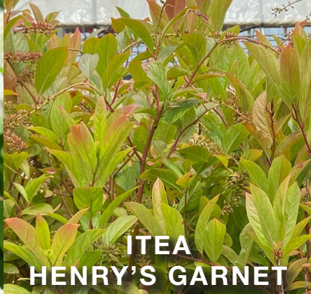
ITEA HENRY'S GARNET