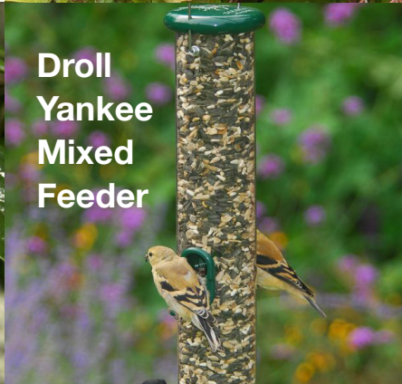
Droll Yankee Mixed Feeder