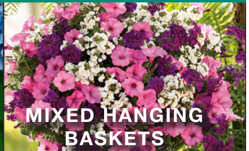
MIXED HANGING BASKETS