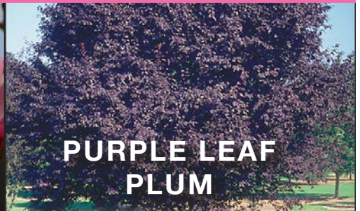
PURPLE LEAF PLUM